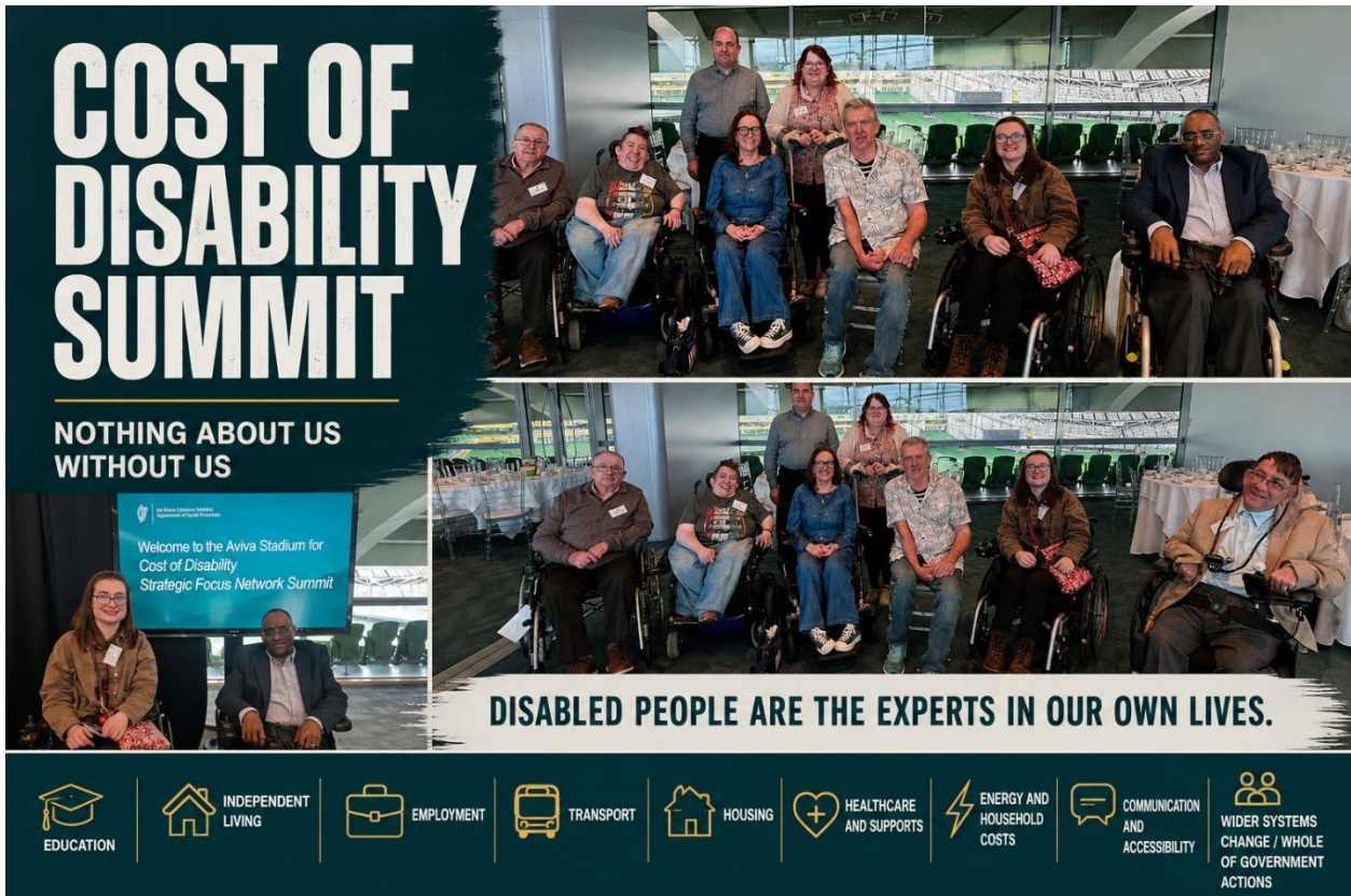
IMAGE: Collage style poster from the Cost of Disability Summit featuring photos of ILMI staff and DPO representatives at the Aviva Stadium during discussions that ranged from education, independent living, employment, transport, housing, healthcare to supports, energy costs, communication and accessibility, and wider systems change. Large typography reads “Cost of Disability Summit” and “Disabled People are the experts in our own lives.”

ILMI’s Cost of Disability Position Paper is grounded in lived experience, collective discussion and rights based analysis from Disabled People across Ireland.