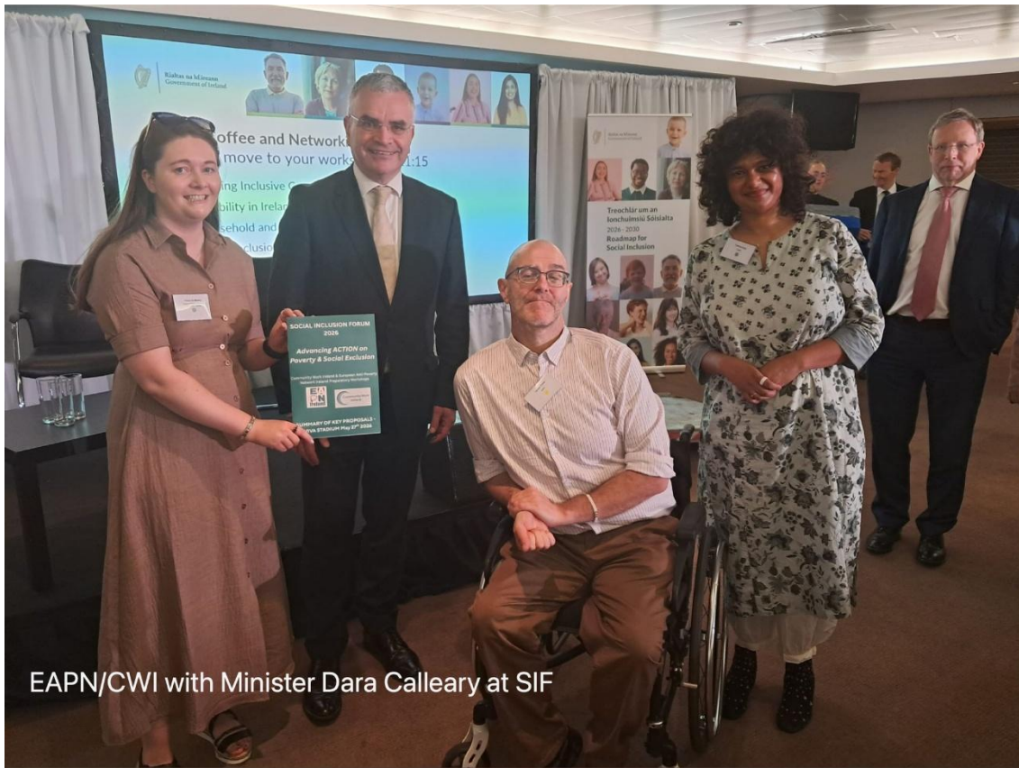
EAPN/CWI with Minister Dara Calleary at SIF