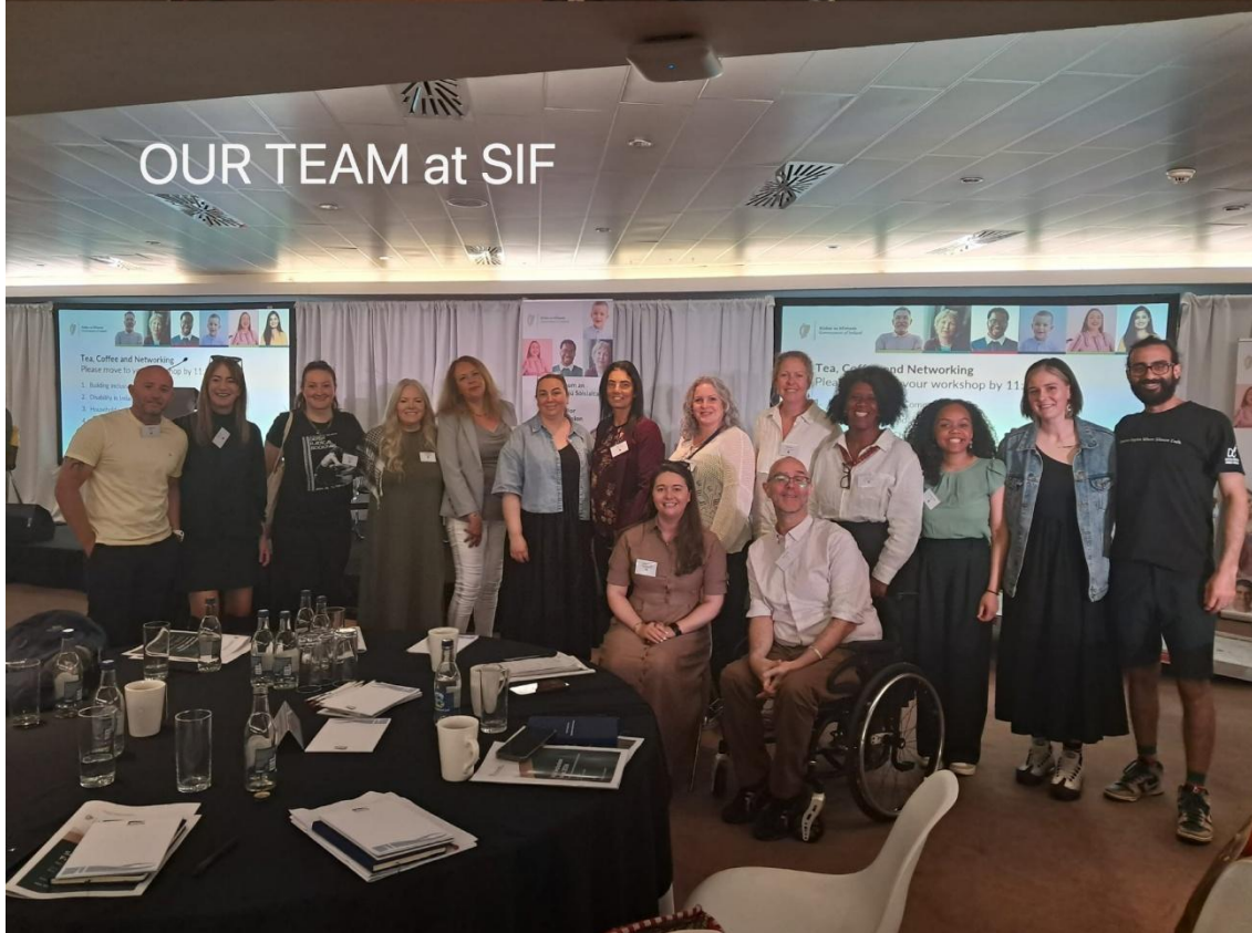
OUR TEAM at SIF