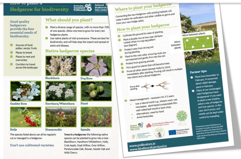
Hedgerow planting flyer