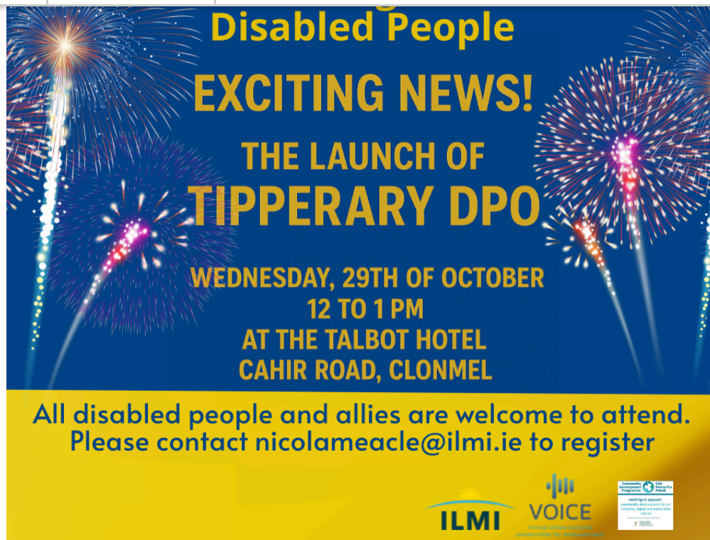
IMAGE: poster with text detailed in article, fire work motifs

Exciting news! The launch of Tipperary DPO is happening on Wednesday, 29th of October from 12 to 1 PM at the Talbot Hotel, Cahir Road, Clonmel, Co. Tipperary, followed by a light lunch.