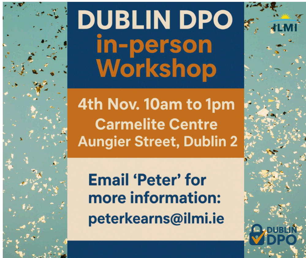
IMAGE: poster with text detailed in post

Disabled people only. Dublin DPO is holding an in-person workshop on Monday 4th November from 10am to 1pm at the Carmelite Centre, Aungier Street, Dublin 2.