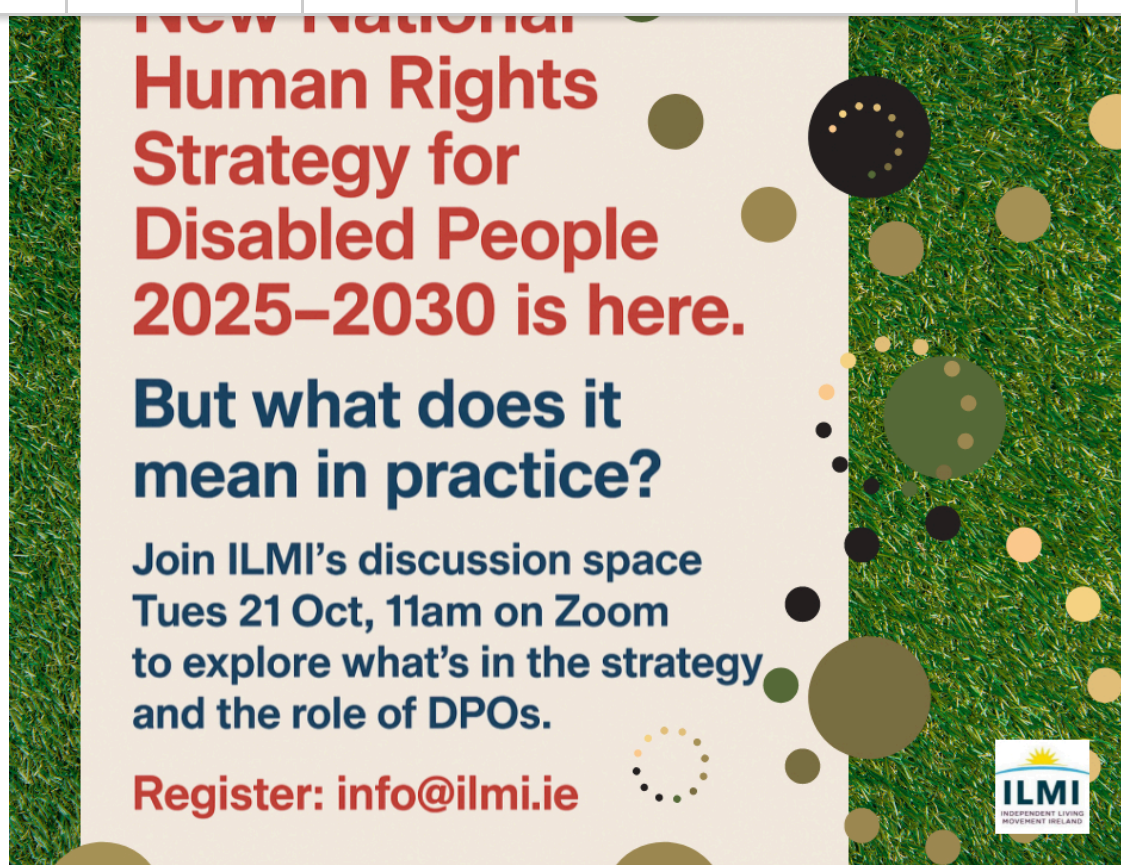
IMAGE: poster with text detailed here

Wednesday 3rd September saw the launch of the National Human Rights Strategy for Disabled People 2025 to 2030.