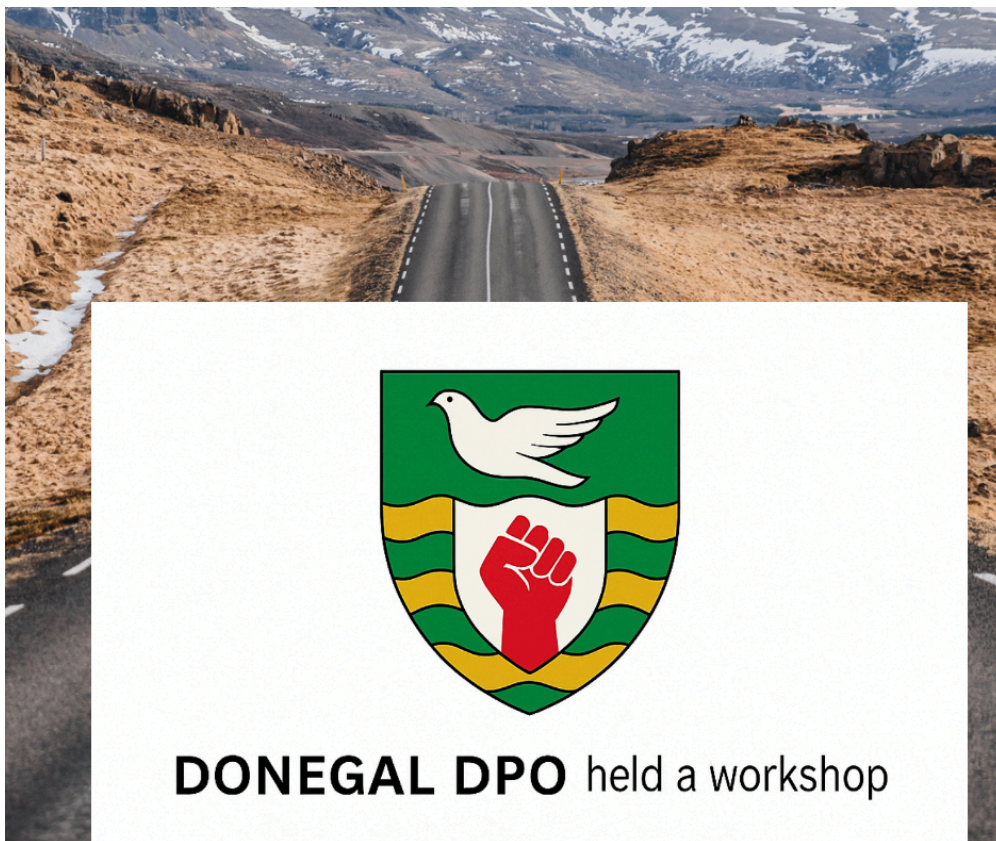
IMAGE: Donegal DPO logo on a photo of a remote road through mountains

Donegal DPO held a lively and well-attended workshop on Thursday 18 September exploring the question “What is a DPO?” The room was packed, with extra chairs needed to accommodate everyone who came along.