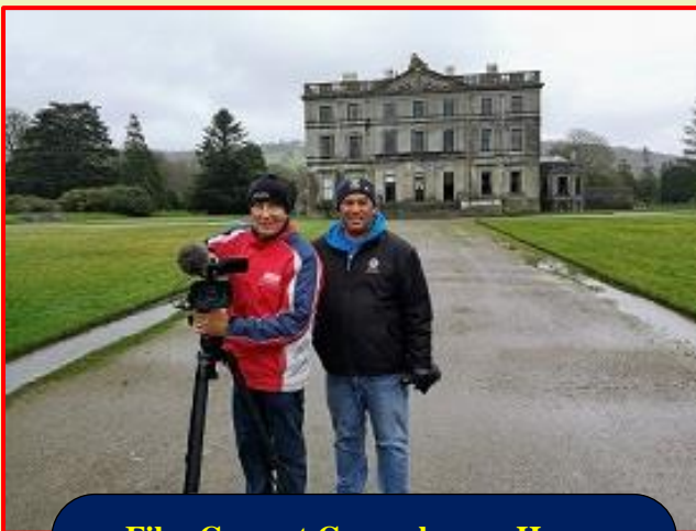
Film Crew at Curraghmore House

€3 Million Invested in Local Community Projects Across the South East