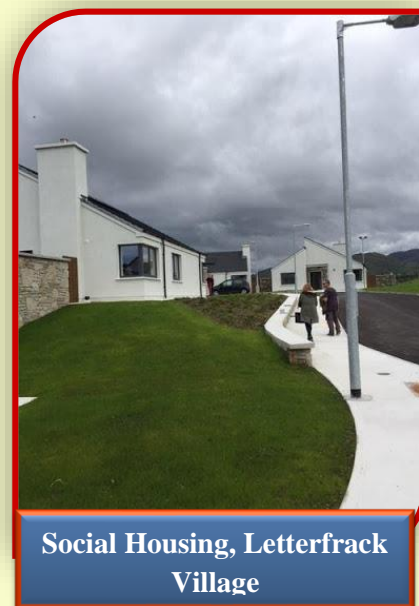
Social Housing, Letterfrack Village