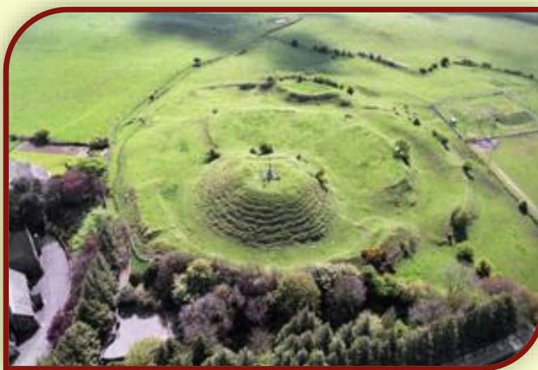
Granard Motte, (pictured above).

In July 2019 Faile Ireland announced grant aid of €640.000 for the Heritage Park and combined with nearly €3 million in funding under the Rural regeneration and Development Fund this enables this key visitor centre attraction to come to life.