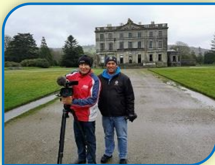
Film Crew at Dunhill Castle & Curraghmore House