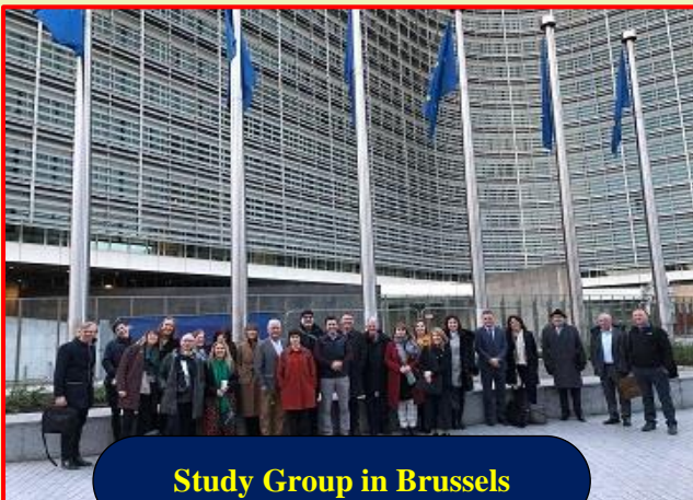
Study Group in Brussels