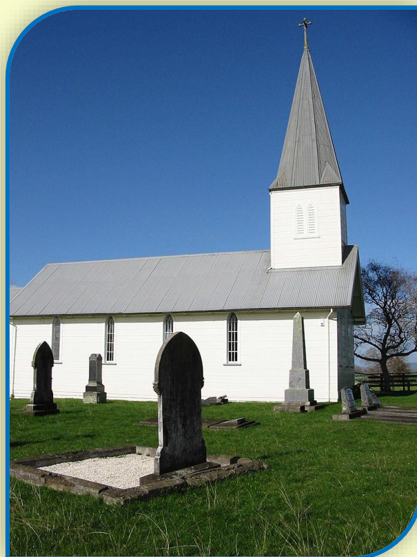
Gifts Being Exchanged, (Above), and (Right), St. Paul’s Church, Rangiaowhia, There Since the Massacre in 1864

Please be Aware of the Coronavirus COVID-19 and Follow Best HSE Advice