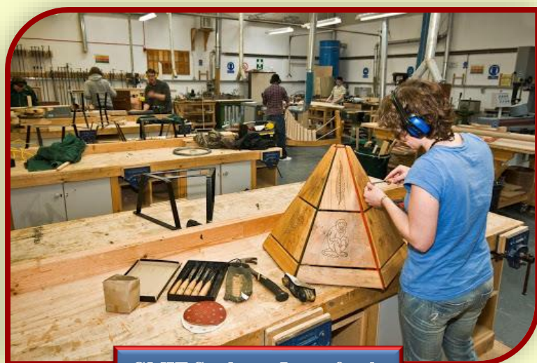
GMIT Students, Letterfrack

The parish is an English-speaking area outside of the Connemara Gaeltacht . For close on 50 years Connemara West has been an innovation enabler and development catalyst in this region and helped create a resilient community. In some cases, the company directly established projects to address community needs. Over time some of these projects became independent projects in their own right and continue to positively impact on the community. In other cases, Connemara West partnered with public and private organisations in Ireland and abroad in order to achieve its goals. At other times, standalone projects or companies were directly created by Connemara West . Different responses at different times were needed to address community needs and opportunities.