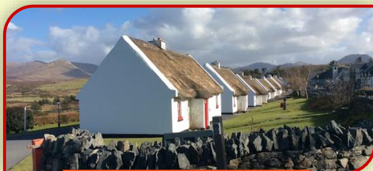
Connemara Cottages, Tullycross

For more information on Connemara West click here Connemara West