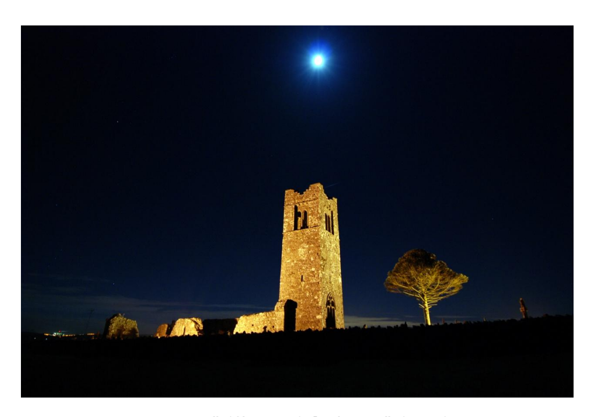
Hill of Slane at Night

Leaving or throwing litter in a public place or in any place that is visible from a public place is an offence which can be subject to an on the spot fine of €150 or a maximum court fine of €4,000. A person convicted of a litter offence will also be required to pay the local authority's costs and expenses in investigating the offence and bringing the prosecution to court, including legal fees.