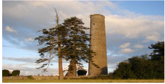
Donaghmore Round Tower

For all the County's beauty and natural resources, litter remains a serious threat. Its presence devalues our living environment, generates a negative impression of our County and places a huge financial burden on County Council finances. Litter pollution does not just affect towns and villages but also our roadsides, protected areas, amenity areas, beaches, bogs, etc. By allowing this very visible form of pollution to continue, it will have an adverse affect on us who live and work in the county and also those who visit us and who are critical to our economy during these difficult economic times.