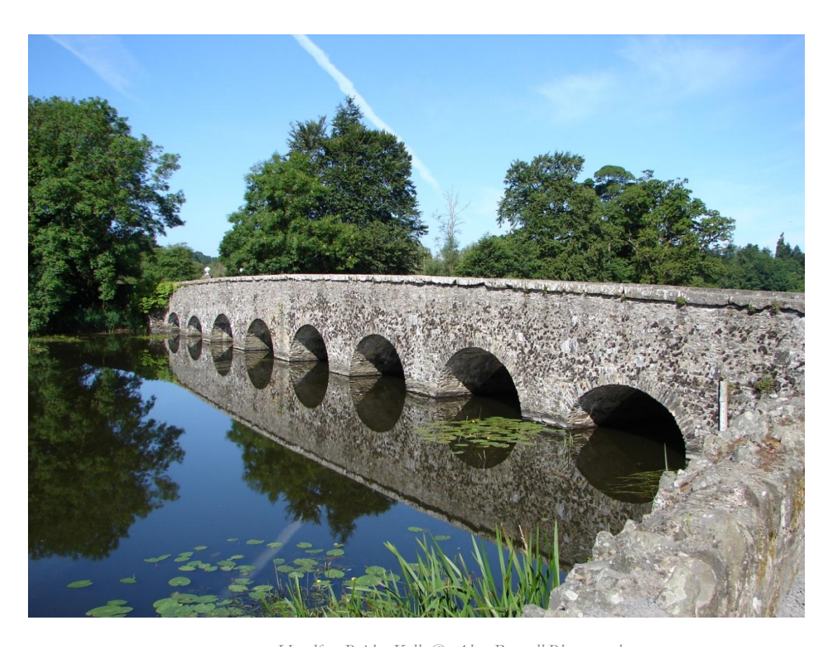
Headfort Bridge Kells

Major and Minor Events generating litter – Events such as sporting events, concerts, festivals etc. can generate a substantial amount of litter. The nature of the litter is usually casual and package related. Events Management Plans deal with waste and litter arising as part of the planning process for large events.