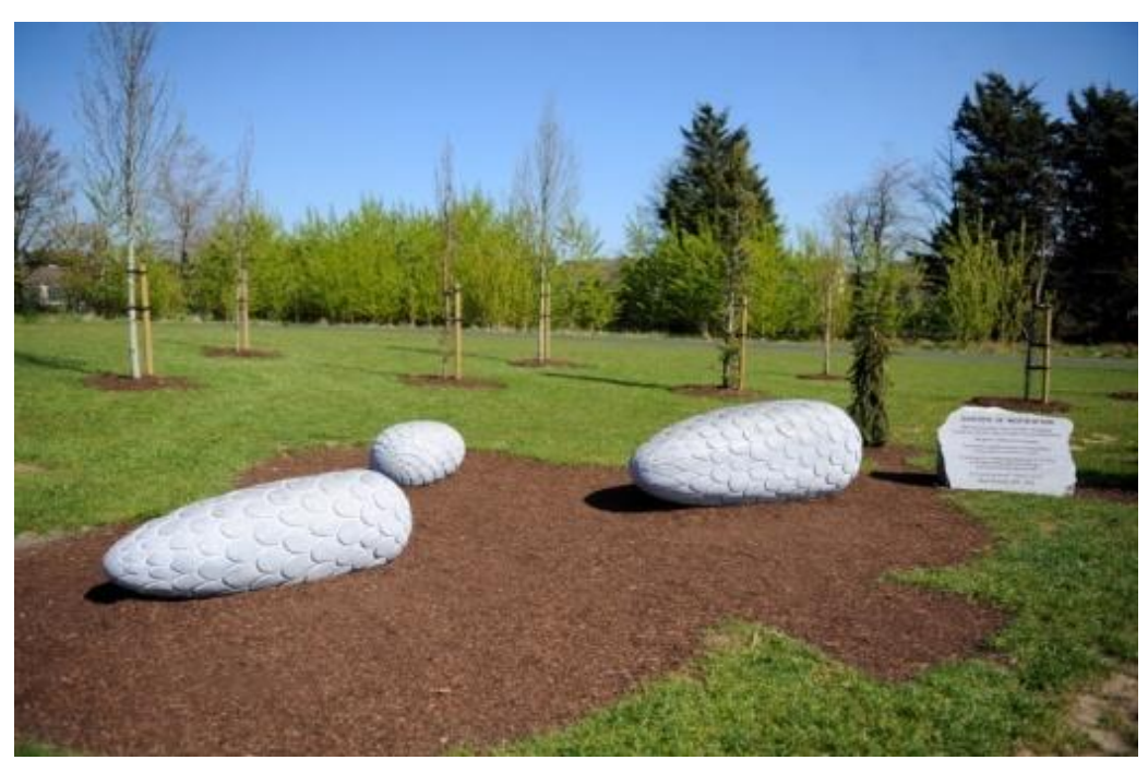
Blackwater Park, Navan