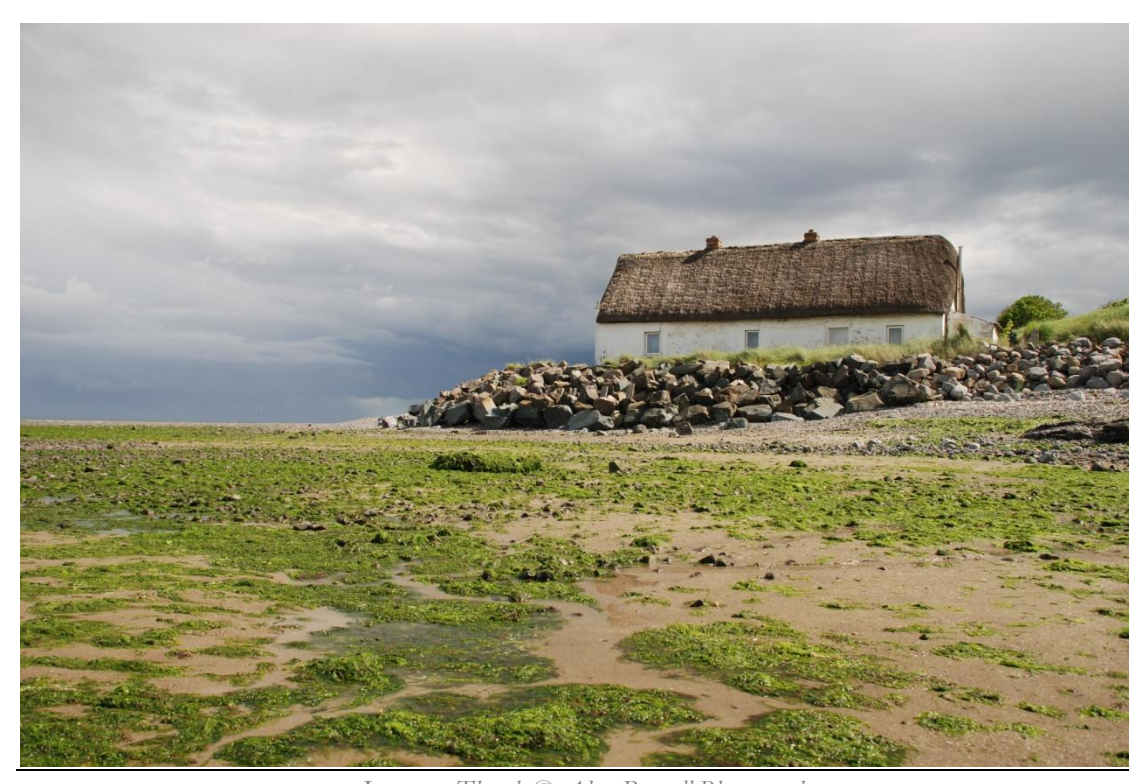
Laytown Thatch

Every effort will be made to increase the numbers participating in Green Schools, Pride of Place, Spring Clean, Green Dog Walkers Programme and other such environmental campaigns all of which are hugely effective in the fight against litter.